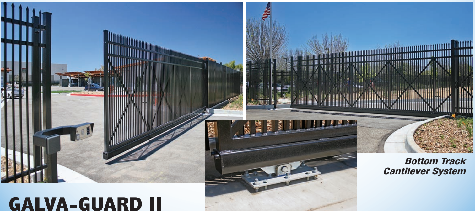
Bottom Track Cantilever System

8' TALL EXTRA HEAVY ARISTOCRAT - BOTTOM TRACK CANTILEVER SLIDE GATE